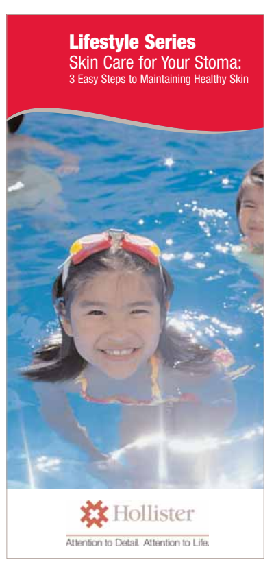
click here to download brochure PDF

If your skin is damaged, open, and moist, the skin barrier will not adhere well. You need to determine the cause of the damage or irritation. Guessing is usually not a good idea. When talking with your WOC/ET nurse, they may recommend that you use a skin barrier powder to dry up the moist skin. Once your skin recovers you can stop using the powder.