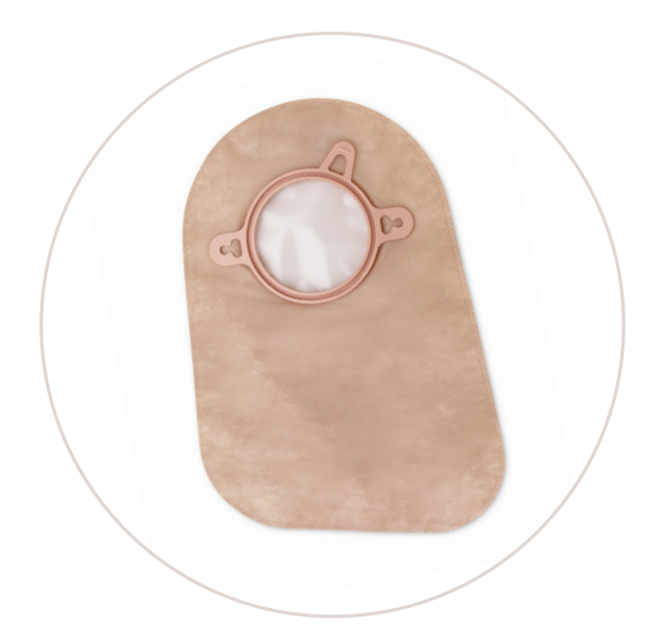
Hollister New Image closed pouch.