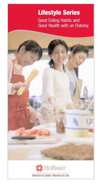
click here to download brochure PDF