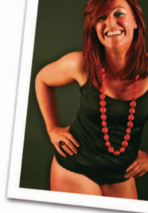
The Vanessa Camisole with panty or thong. Available in black or white.