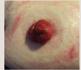
Photo 1 Areas of irritated peristomal skin.